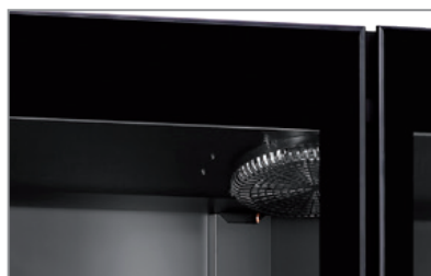
Porta vetro senza cornice Full glass frameless door