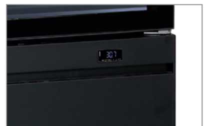
Termostato digitale Digital thermostat