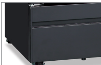
Superficie esterna in lamiera nera opaca Matte black prepainted sheet