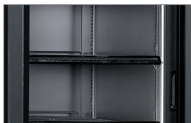
Luci led Led lighting