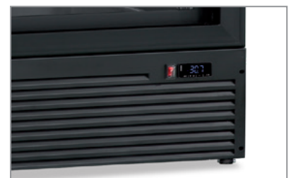
Termostato digitale Digital thermostat