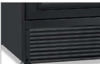
Superficie esterna in lamiera nera opaca Matte black prepainted sheet

Dati indicativi e variabili a seconda dei diversi packaging / Variable data depending on the different packaging