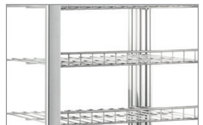
Mensole a filo in acciaio inox AISI 304 Stainless Steel AISI 304 wire shelves