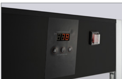
Termostato elettronico Electronic thermostat

Vetrina sopra banco calda. Heated countertop display