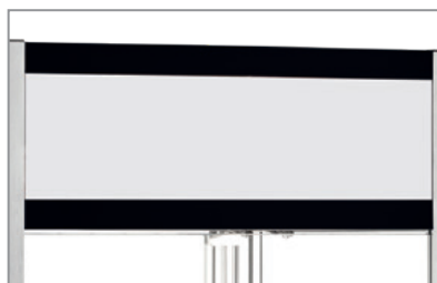
Cassonetto retroilluminato Backlight canopy