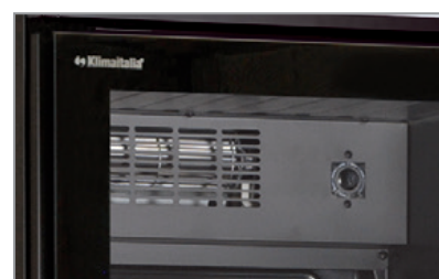
Porta vetro senza cornice Full glass frameless door