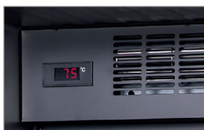
Termometro digitale Digital thermometer

Dati indicativi e variabili a seconda dei diversi packaging / Variable data depending on the different packaging