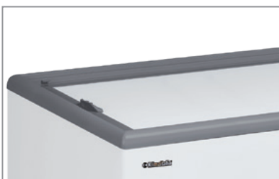
Porte cieche scorrevoli Solid sliding lids

Congelatore statico a pozzo - porta cieca scorrevole. Static chest freezer with solid sliding lids.