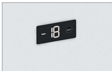
Termometro digitale Digital thermometer