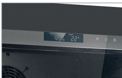
Termostato digitale Digital thermostat