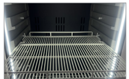
Mensole in metallo Metal shelves