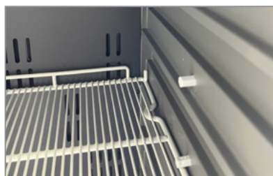
Interno in ABS termoformato Thermoformed ABS inner liner