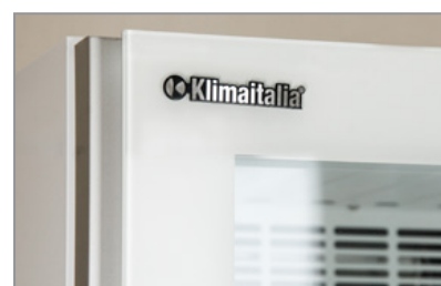
Porta a sfioro senza cornice Full glass frameless door