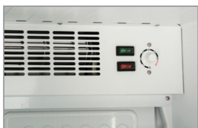
Regolatore di temperatura meccanico (ICOOOL 401) Mechanical controller (ICOOOL 401)

Dati indicativi e variabili a seconda dei diversi packaging / Variable data depending on the different packaging